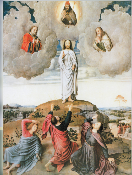
Cover design ©Liturgical Publications Inc. Image of The Transfiguration by Gerard David © 2007 by Dover Publications, Inc.