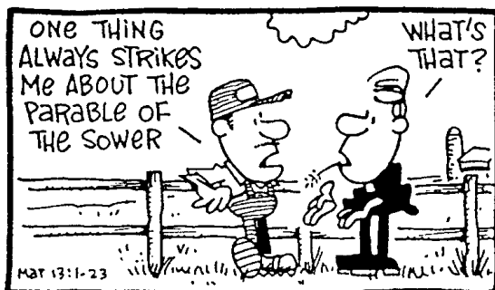
15 th SUNDAY IN ORDINARY TIME