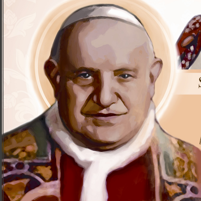
SAINT JOHN XXIII

"Peace is but an empty word, if it does not rest upon that order...that is founded on truth, built up on justice, nurtured and animated by charity, and brought into effect under the auspices of freedom...human resources alone, even though inspired by the most praiseworthy good will, cannot hope to achieve it. God Himself must come to man's aid with His heavenly assistance." —Pacem in Terris