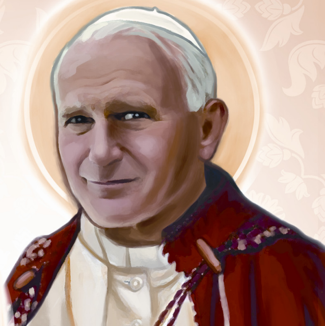
SAINT JOHN PAUL II

"Peace is but an empty word, if it does not rest upon that order...that is founded on truth, built up on justice, nurtured and animated by charity, and brought into effect under the auspices of freedom...human resources alone, even though inspired by the most praiseworthy good will, cannot hope to achieve it. God Himself must come to man's aid with His heavenly assistance." —Pacem in Terris